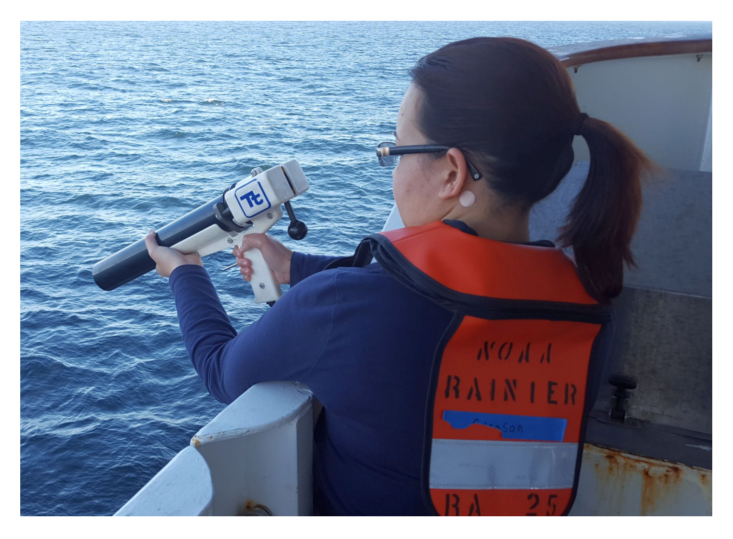
Figure 4: Deploying a XBT from the port-side bridge wing of Rainier.