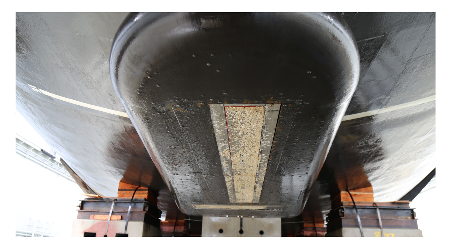
Figure 2: Kongsberg EM710 sonar transducer housing on Rainier (S221).