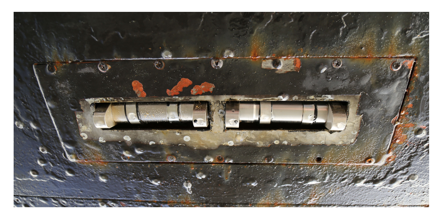
Figure 3: Dual SVP 70s mounted in Rainier's multibeam sonar transducer gondola.