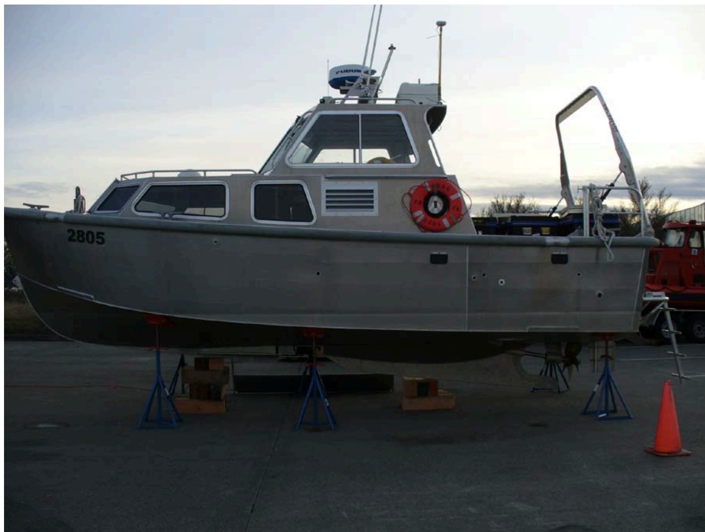
Figure 2: FA 2805