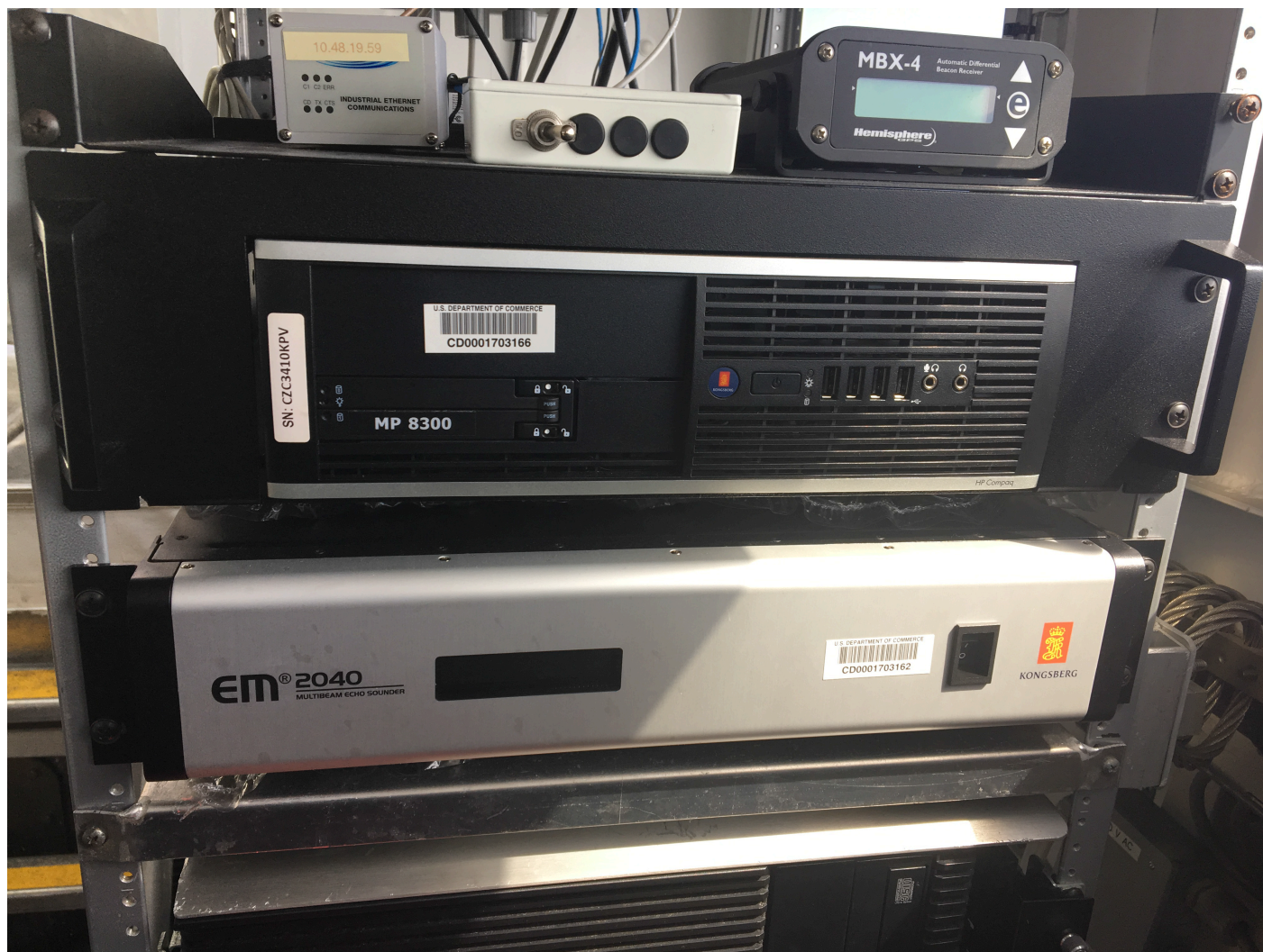
Figure 7: EM 2040 topside processing unit