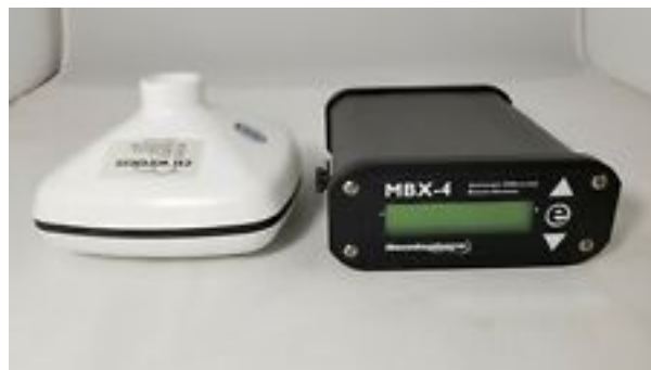
Figure 10: MBX-4 DGPS