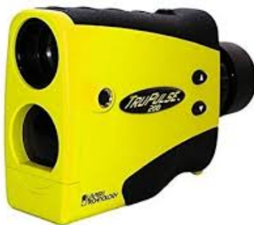
Figure 11: TruPulse 200 Laser Rangefinder