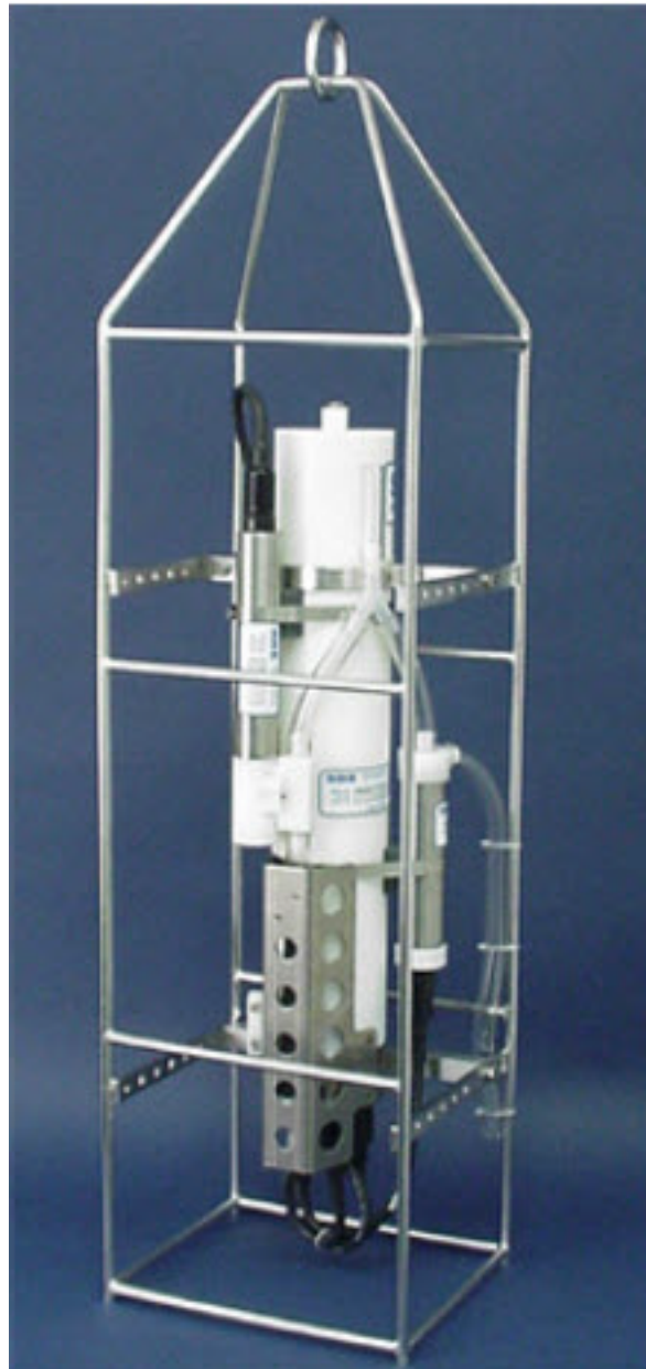
Figure 5: SBE 19plusV2