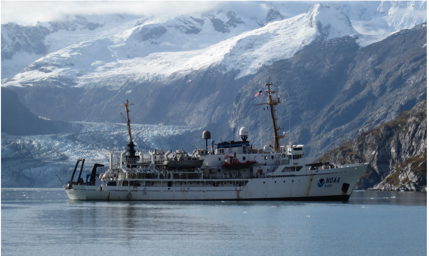
Figure 5: NOAA Ship Fairweather S220