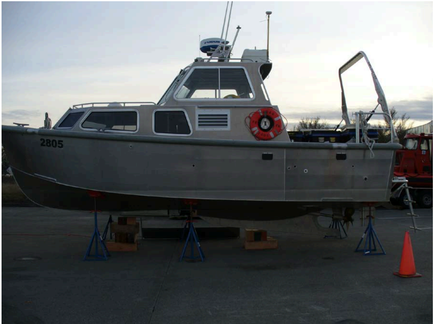
Figure 2: FA 2805