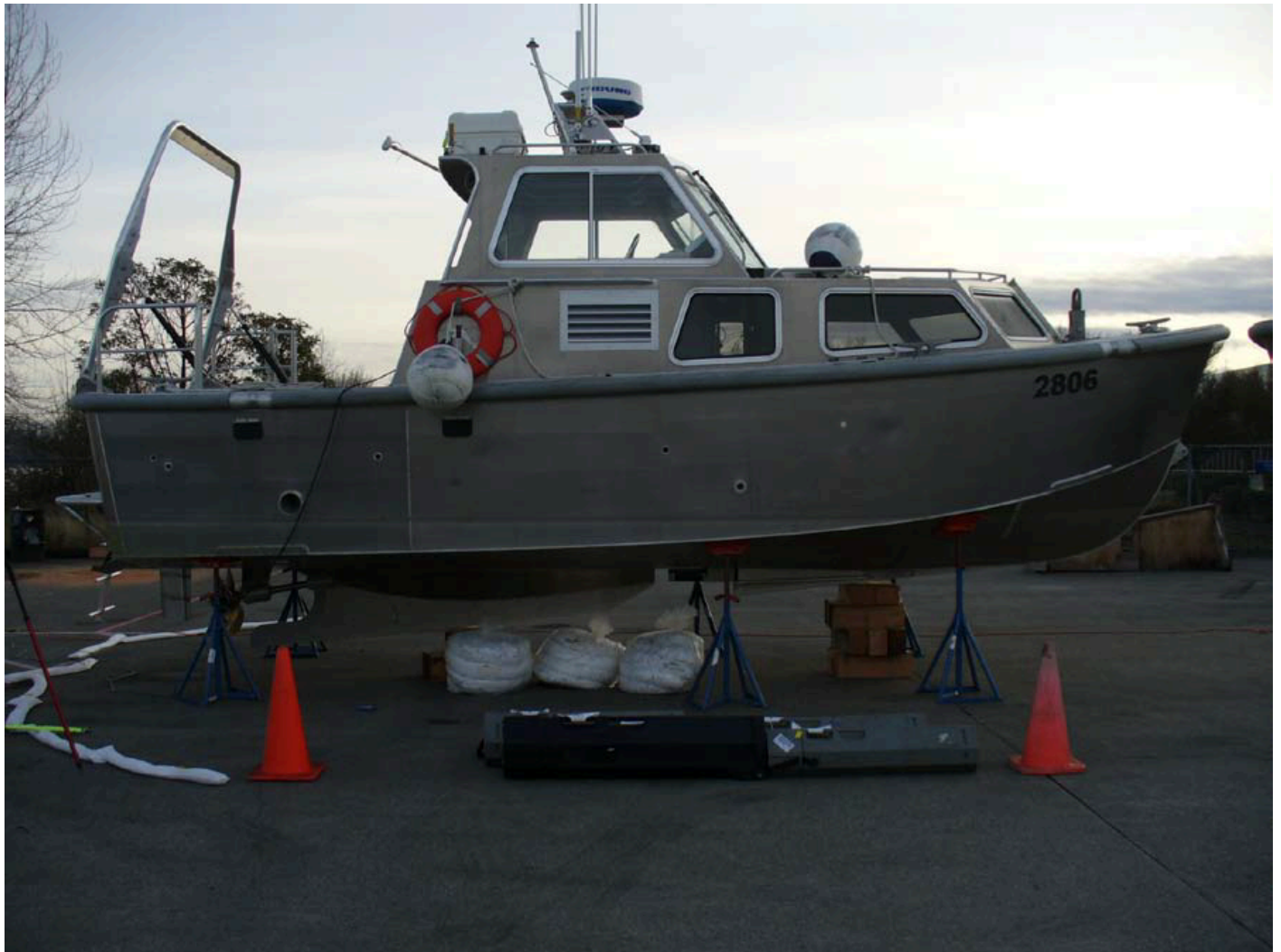
Figure 3: FA 2806