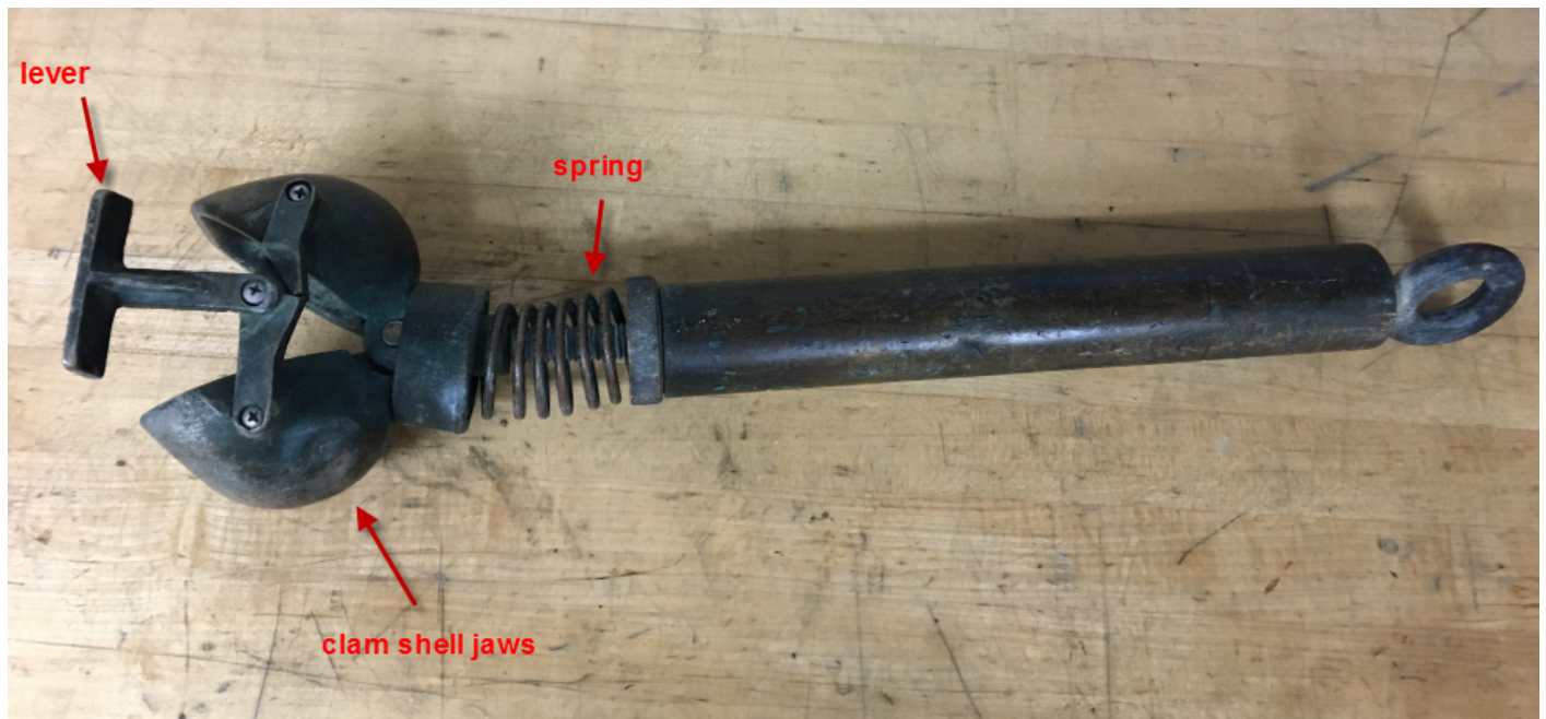
Figure 11: Mud Snapper style grab sampler used about NOAA Ship Fairweather launches.