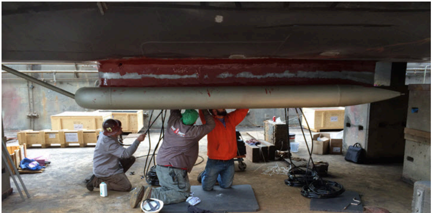
Figure 6: EM 710 gondola during transducer installation