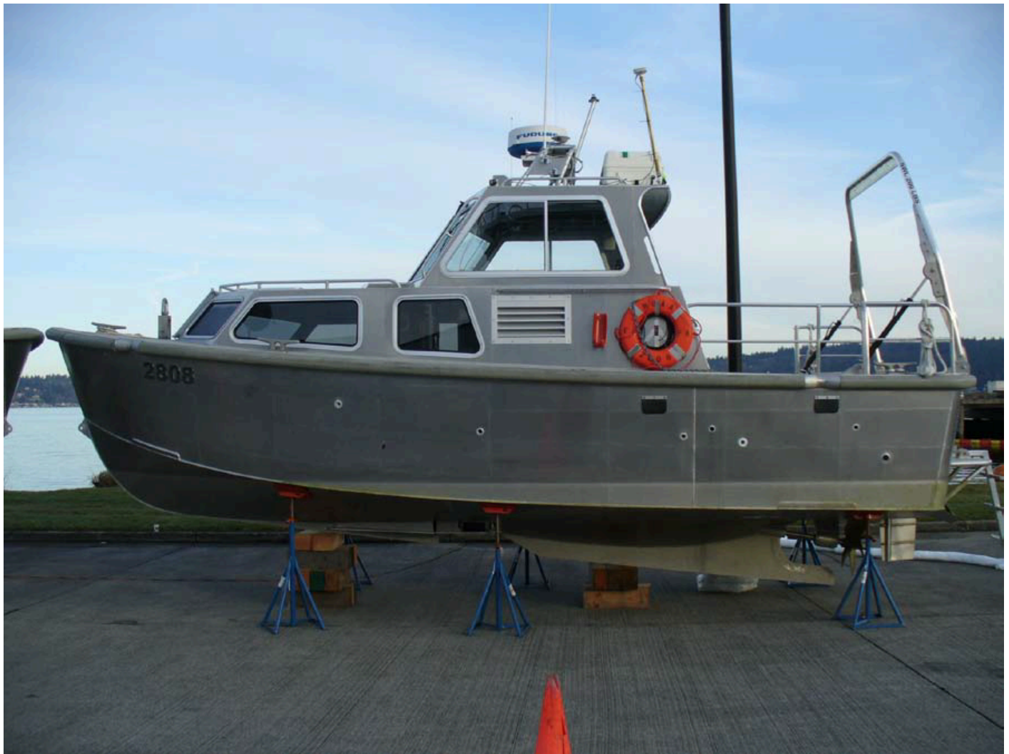
Figure 5: FA 2808