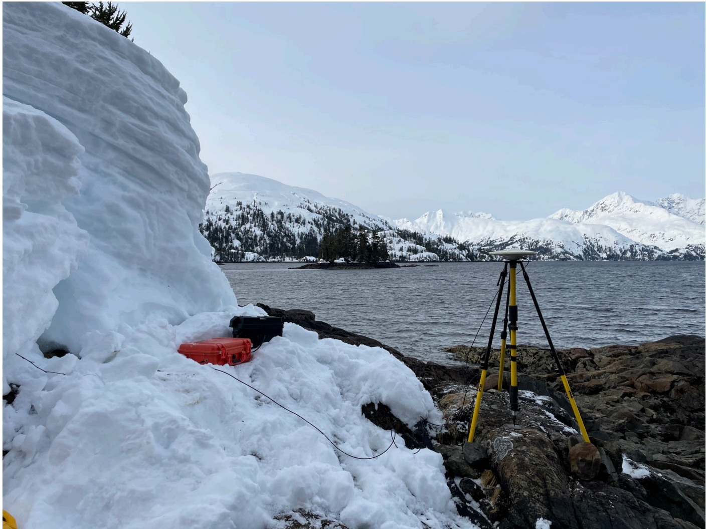
Figure 8: Base Station in Cochrane Bay