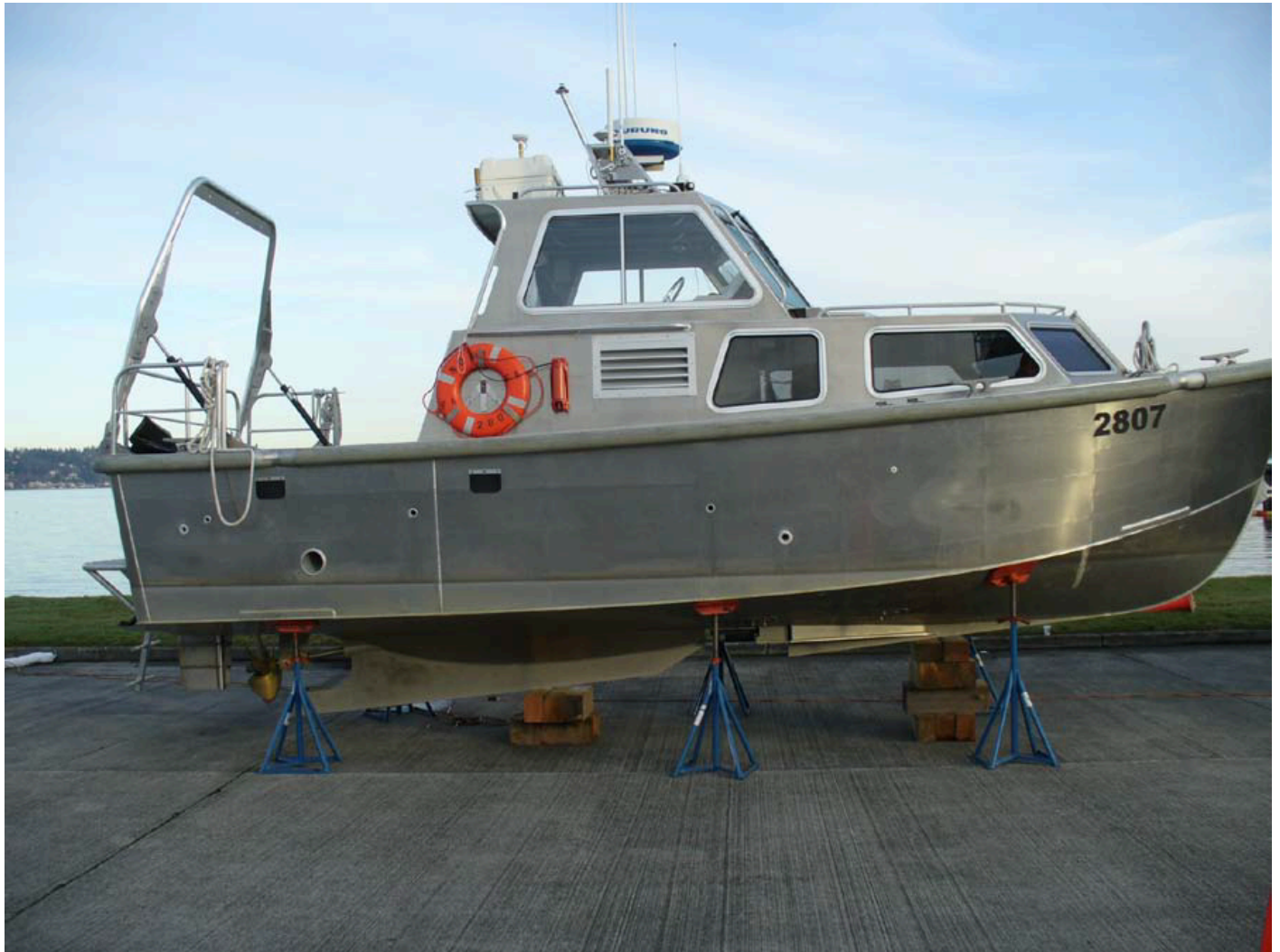
Figure 4: FA 2807