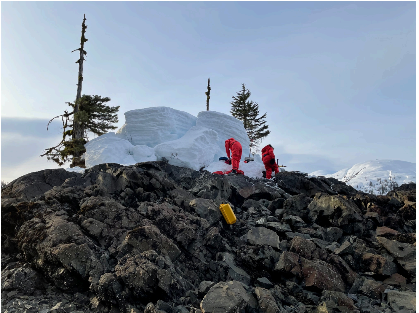
Figure 16: Personnel installing a base station on in Cochrane Bay