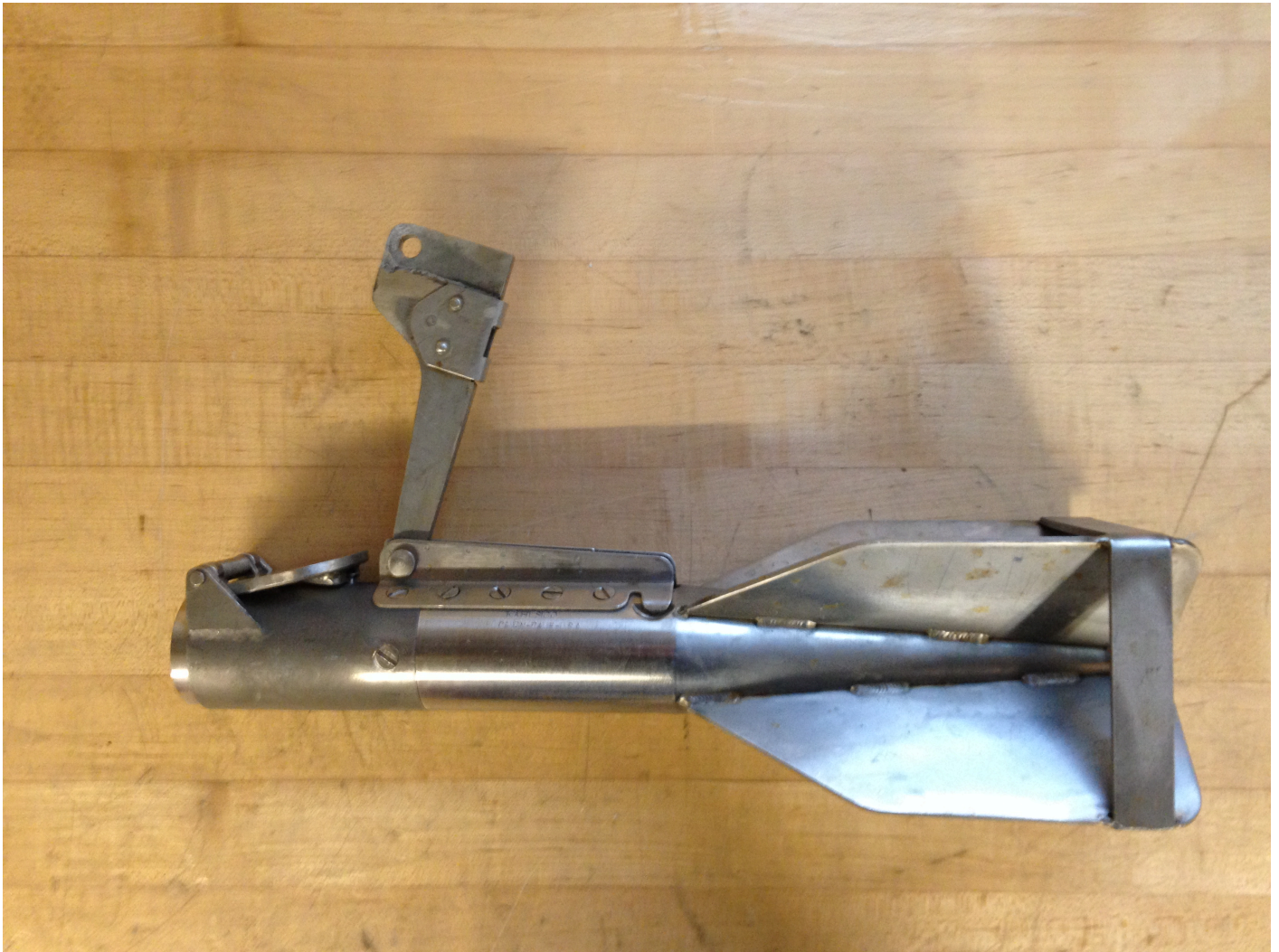
Figure 11: Torpedo style grab sampler used about NOAA Ship Fairweather launches.