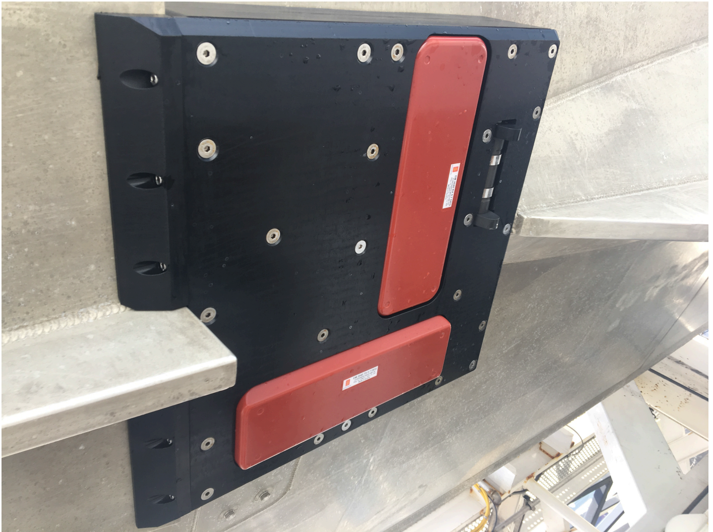
Figure 5: EM 2040 Transceiver Array