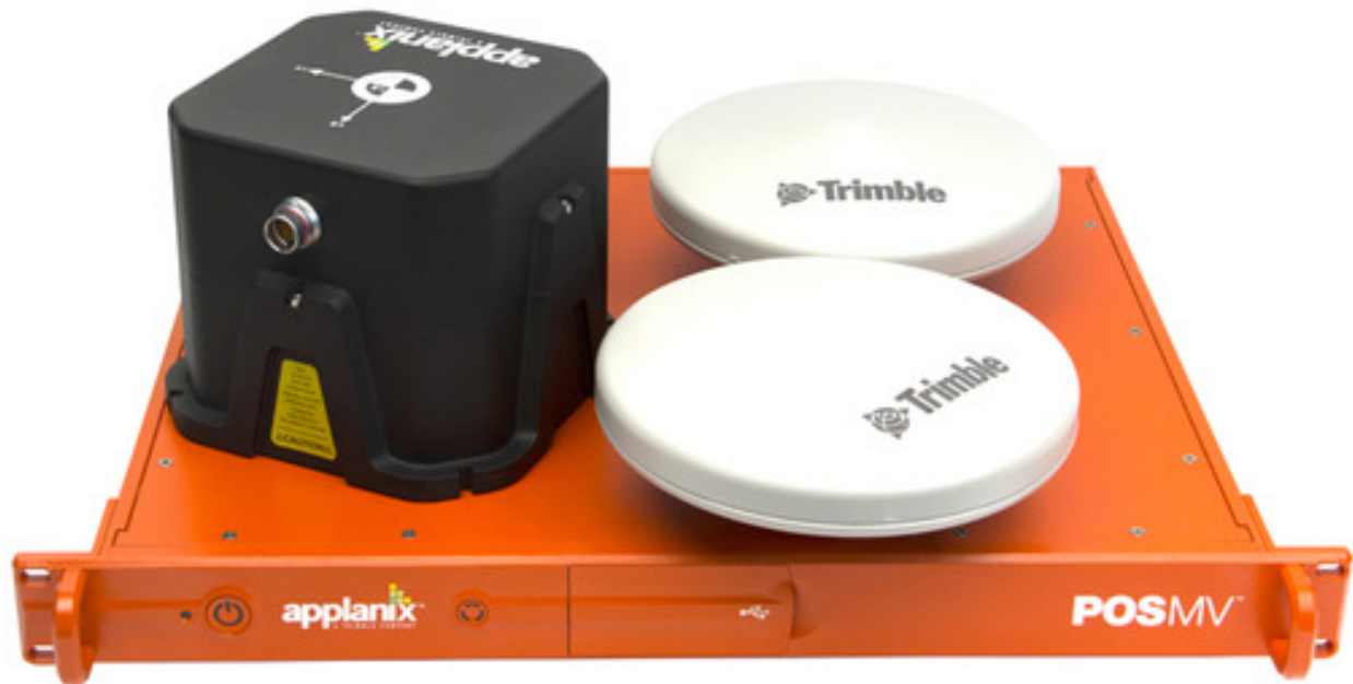
Figure 6: POS MV 320 V5 System