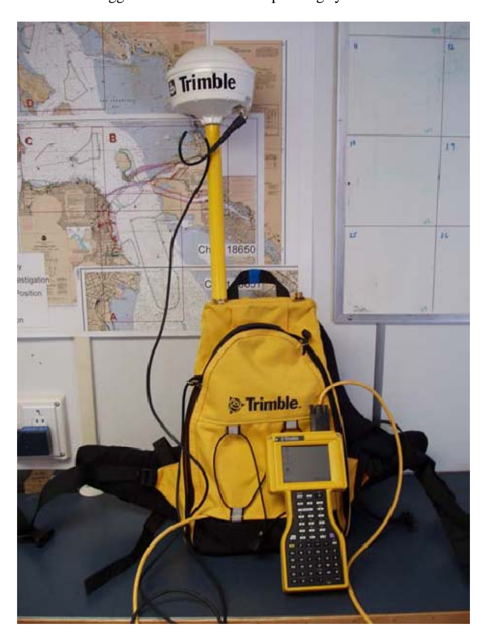
Trimble backpack unit

The ProXRS receiver is set to collect data using the following restrictions: