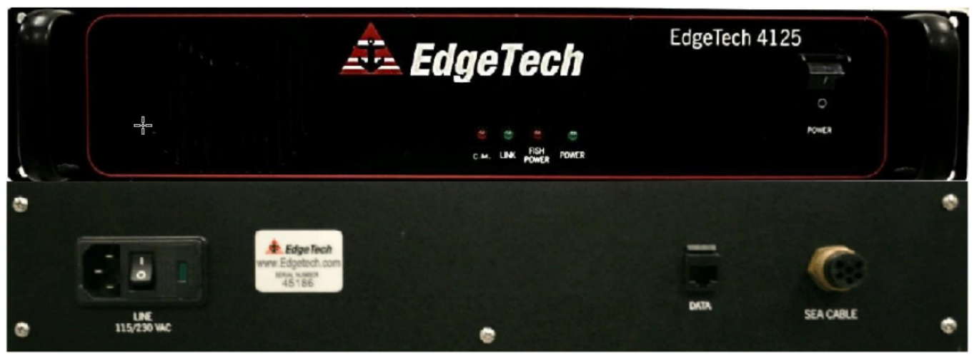
Figure 3: EdgeTech 4125 towfish and rack mount processing unit.