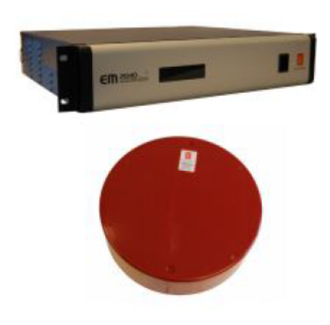
Figure 2: EM 2040C sonar head and processing unit