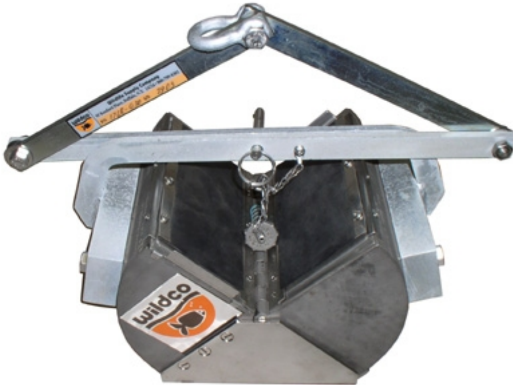
Figure 5: Petite Ponar 6"x6" Bottom Sampler