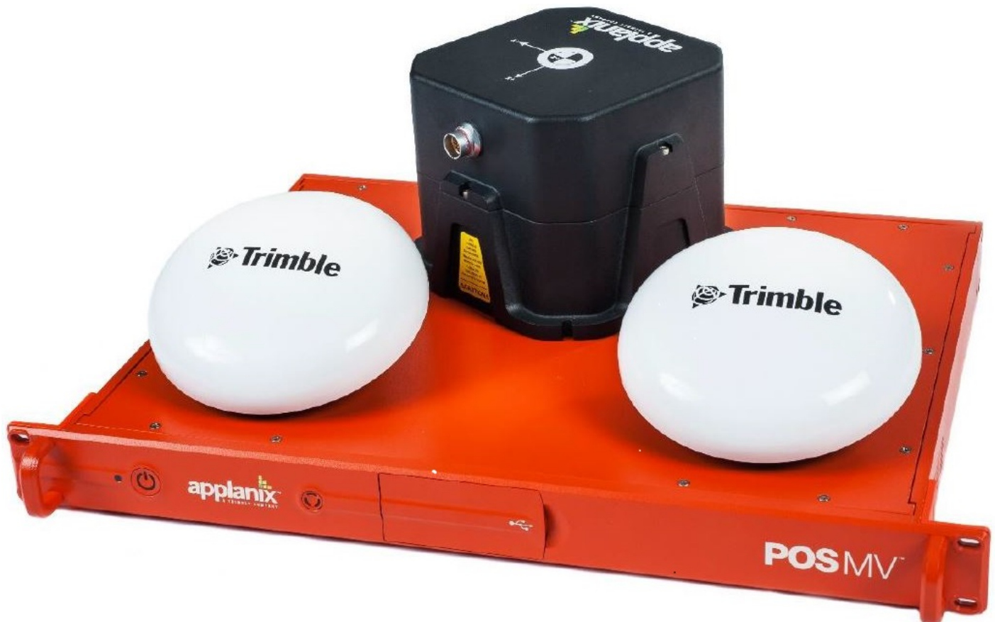
Figure 4: POS MV V5 system components: IMU, POS Computer System, and two GNSS antennas