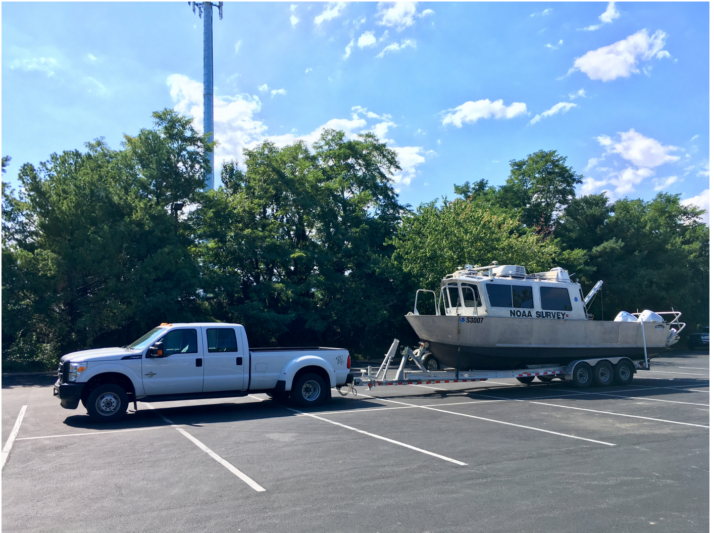
Figure 1: NOAA NRT5 (S3007)