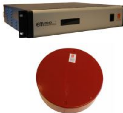
Figure 2: EM 2040C sonar head and processing unit