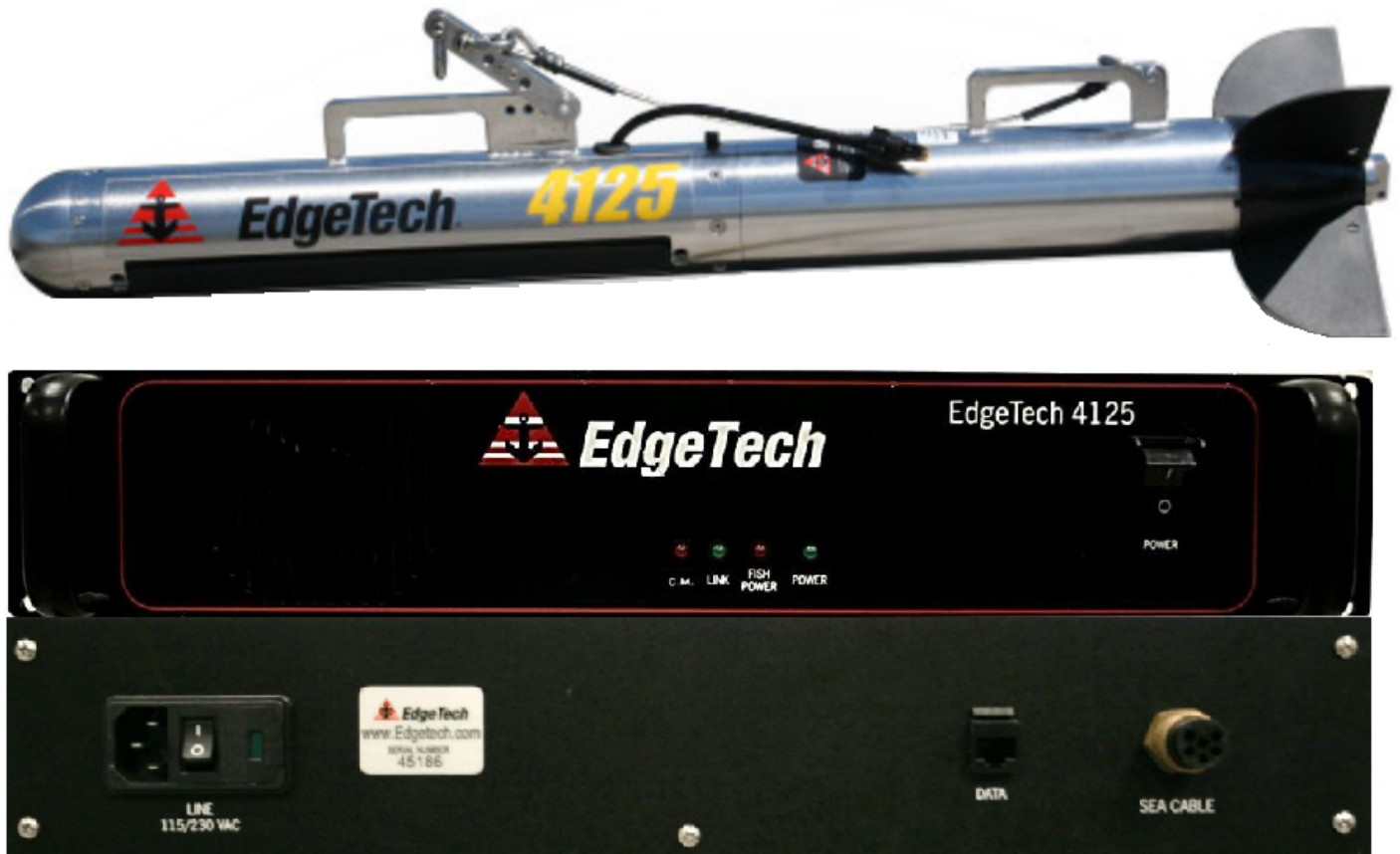
Figure 3: EdgeTech 4125 towfish and rack mount processing unit.