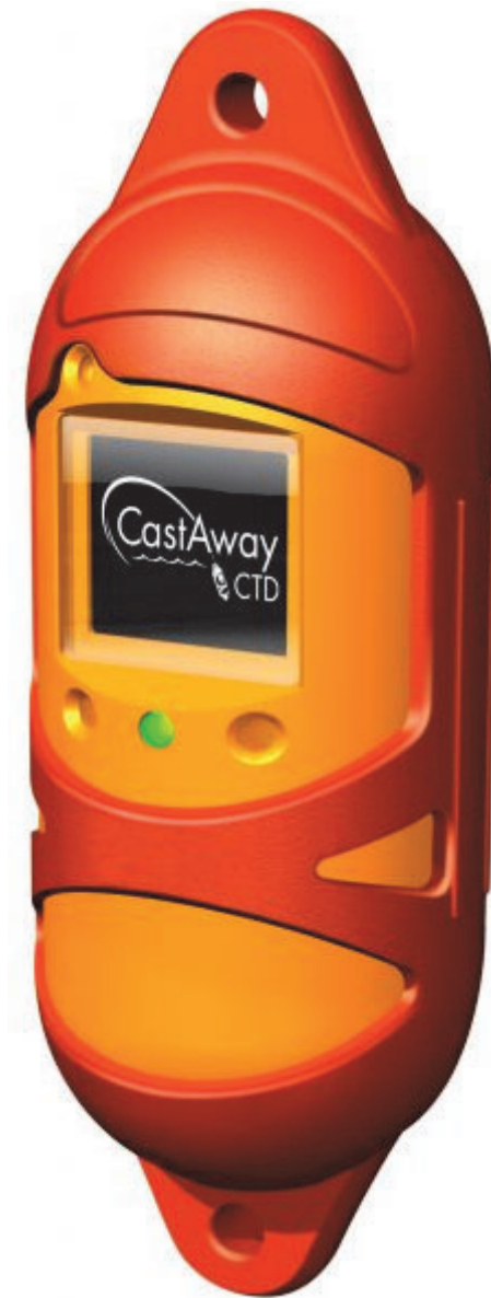
Figure 5: CastAway-CTD.