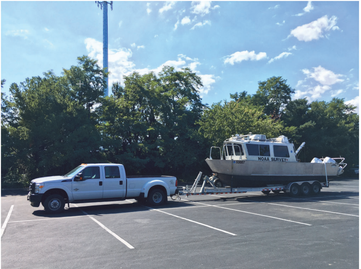
Figure 1: NRT-NL (S3007)