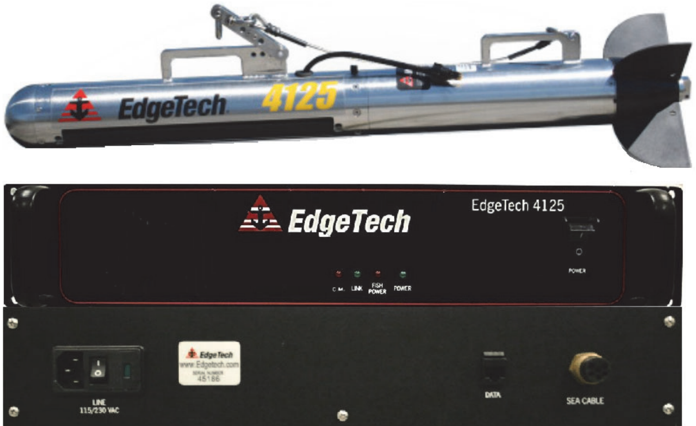
Figure 3: EdgeTech 4125 towfish and rack mount processing unit.