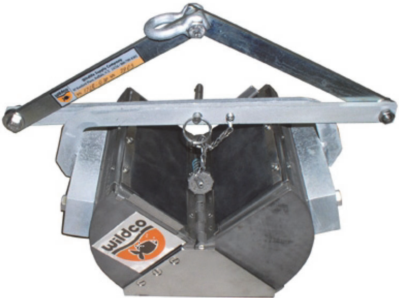
Figure 6: WILDCO Petite Ponar.

The WILDCO Petite Ponar is a Ponar type grab sampler, a commonly used sampler that is very versatile for all types of bottom sediments such as sand, gravel, and clay. This sampler features center-hinged jaws and a spring loaded pin that releases when the sampler makes impact with the bottom. It also includes an underlip attachment that cleans gravel from the jaws that would normally prevent lateral loss of sample. The top is covered with a stainless steel screen with neoprene rubber flaps which allows water to flow through for a controlled descent and less interference with the sample. It is constructed of stainless steel with zinc plated steel arms and weights. A simple pin prevents premature closing.