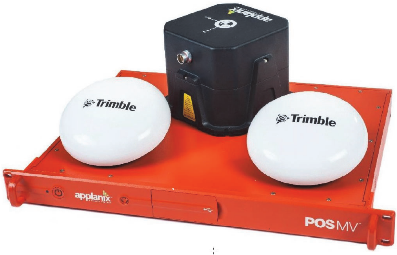
Figure 4: POS MV V5 system components: IMU, POS Computer System, and two GNSS antennas.