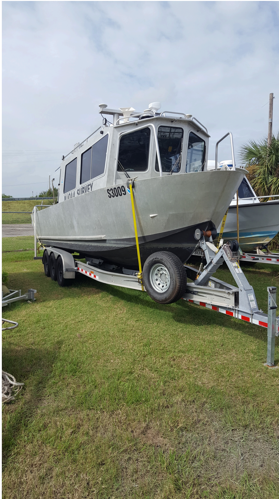
Figure 1: S3009