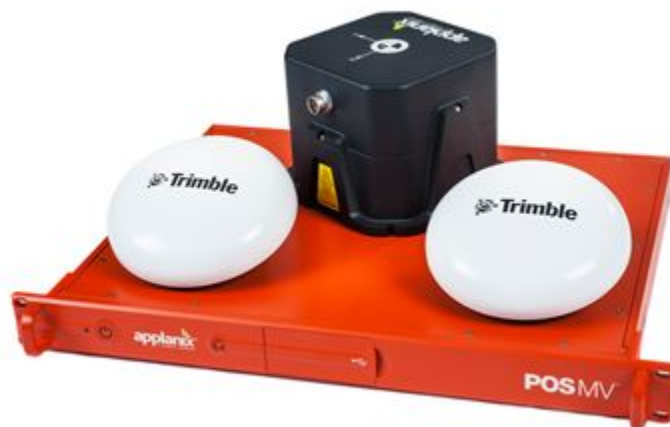
Figure 4: POS MV 5