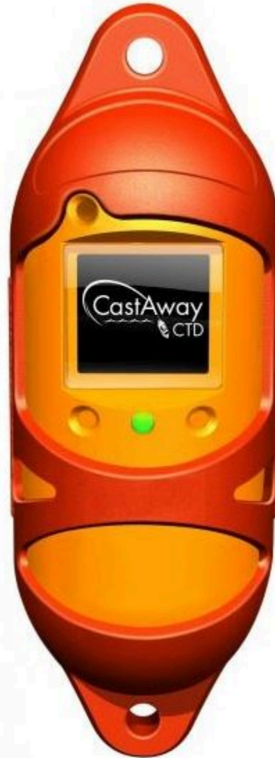
Figure 5: Sontek Castaway