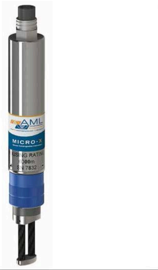
Figure 6: AML Micro-X SV