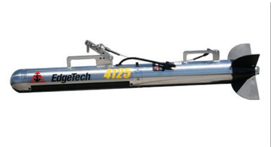
Figure 3: Edgetech 4125