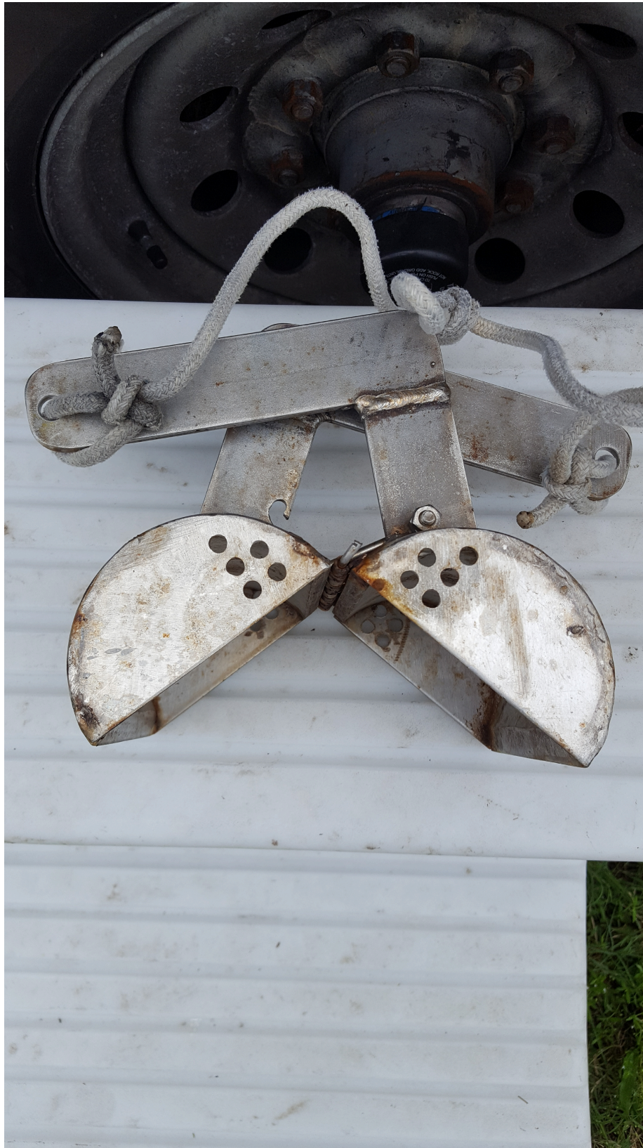
Figure 7: NRT2 Bottom Sampler