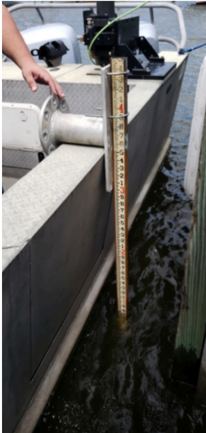
Figure 11: Static Draft Gauge made from tide staff