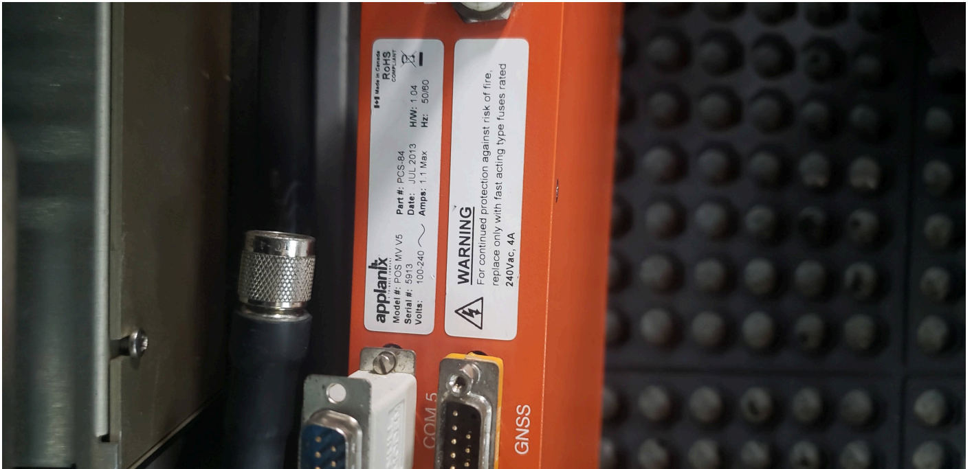
Figure 4: Temporary POSMV-320 TPU loaned by NRB HQ