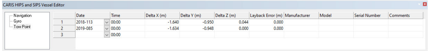
Figure 10: SSS Offsets

NRT1 pole mounts their 4125 using a Universal Sonar Mount attached to the port side of S3005. Position of the towfish is adjusted in the Caris HVF under Tow Point for corrected position. Values did not change from 2019 to 2020. The towfish had not been moved from its original position