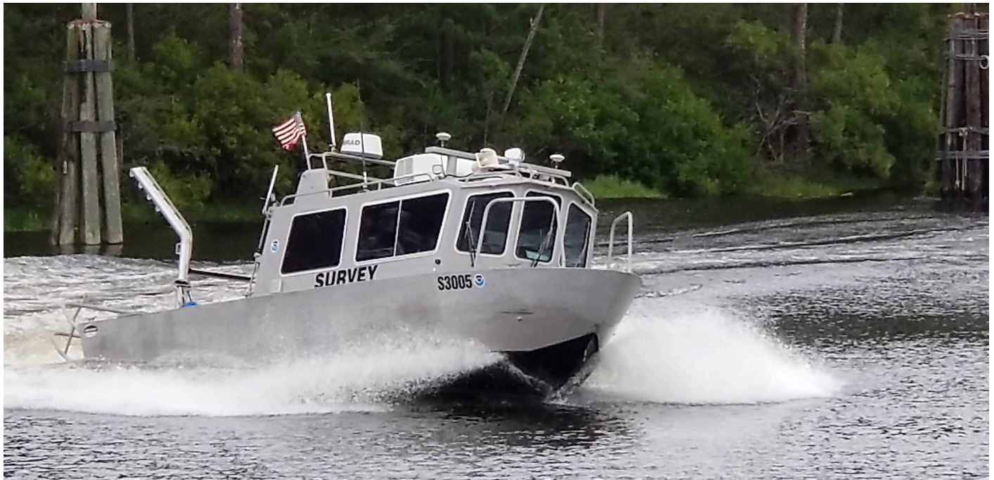
Figure 1: S3005 in canal at Stennis Space Center