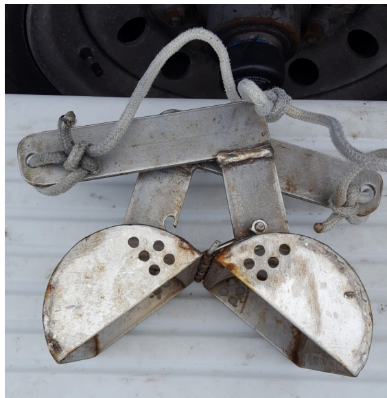
Figure 9: NRT1 Bottom Sampler

4" penetration grab sampler designed to collect unconsolidated bottom material.