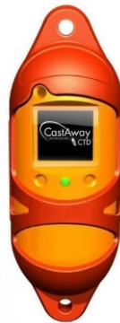
Figure 7: Sontek Castaway