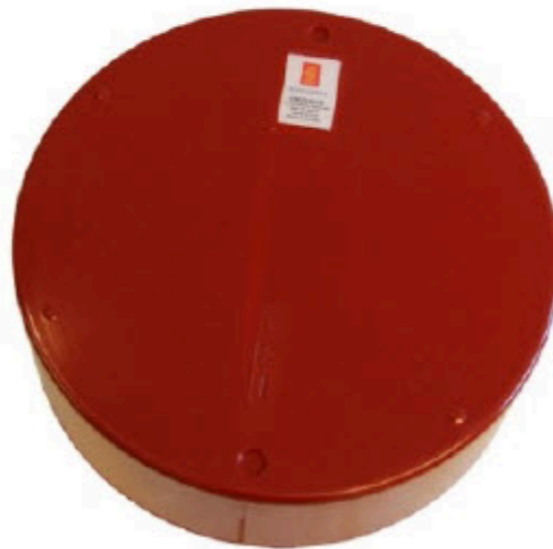
Figure 2: Kongsberg EM2040C