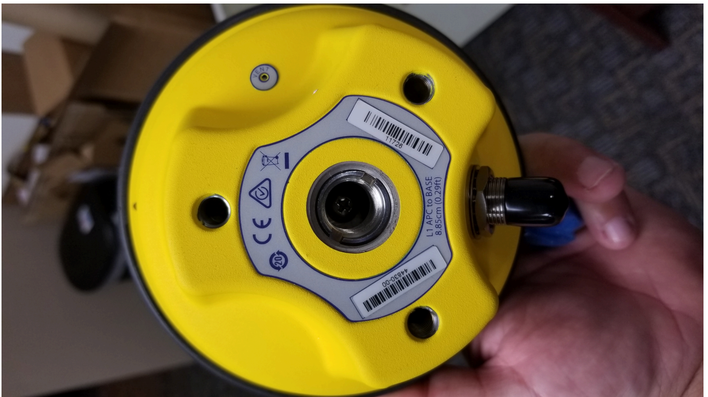
Figure 5: Primary Antenna Trimble GA830