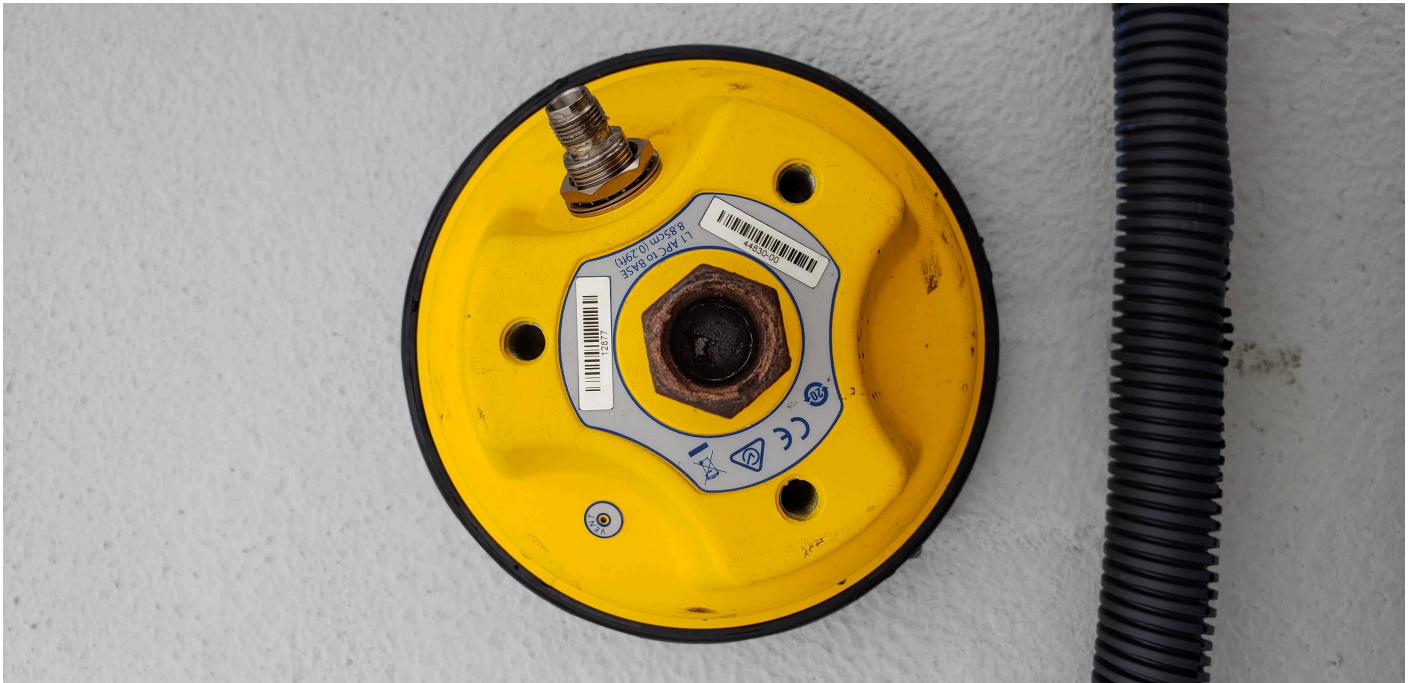
Figure 6: Temporary Secondary Antenna loaned NRB HQ