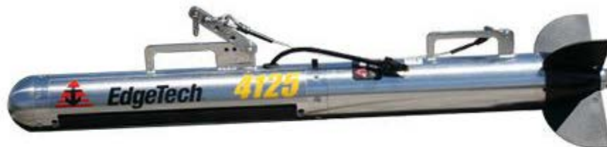
Figure 3: Edgetech 4125