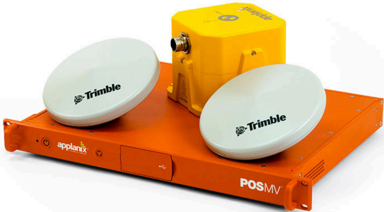
Figure 3: POS MV 320 V5 System