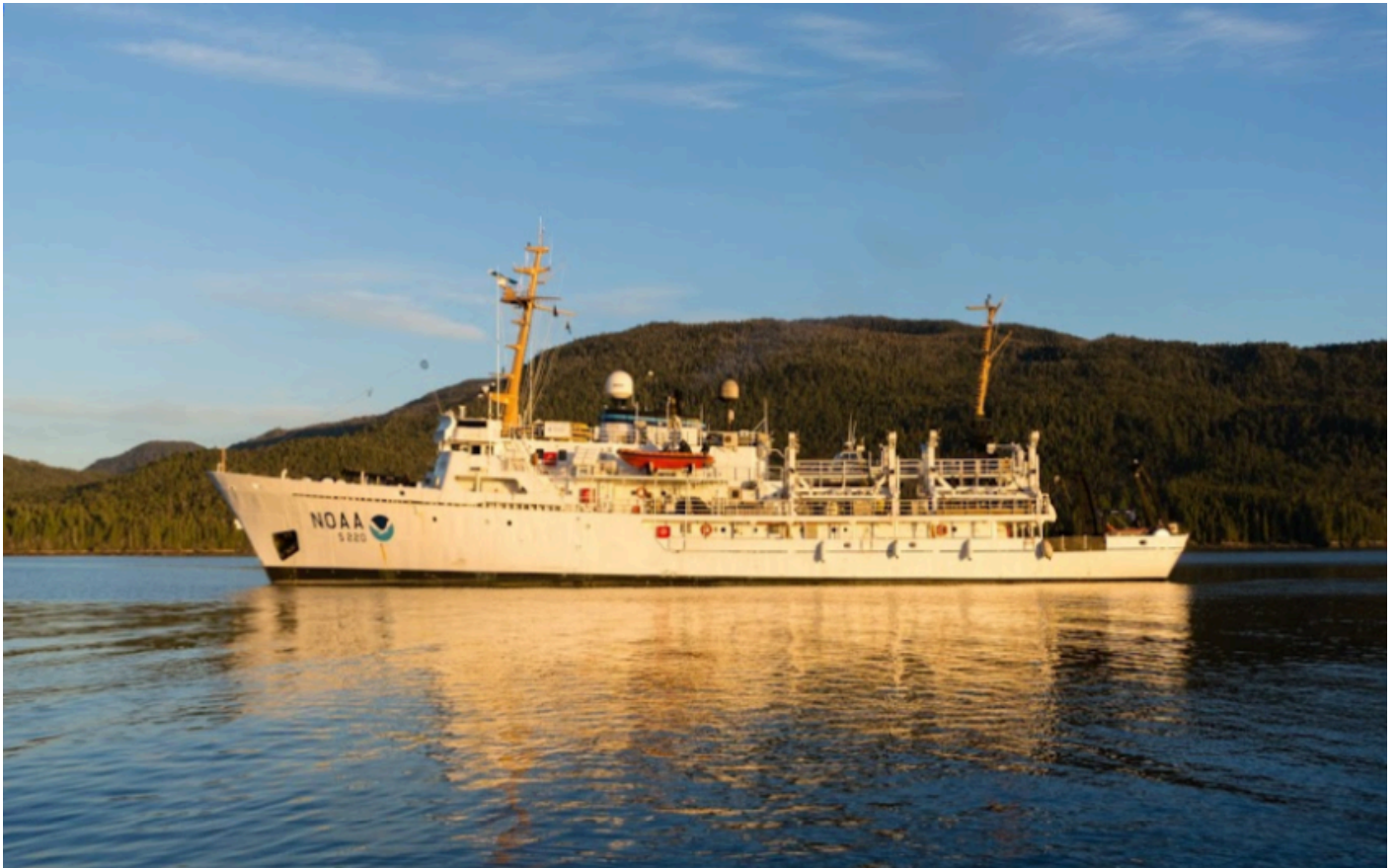
Figure 1: NOAA Ship Fairweather S220