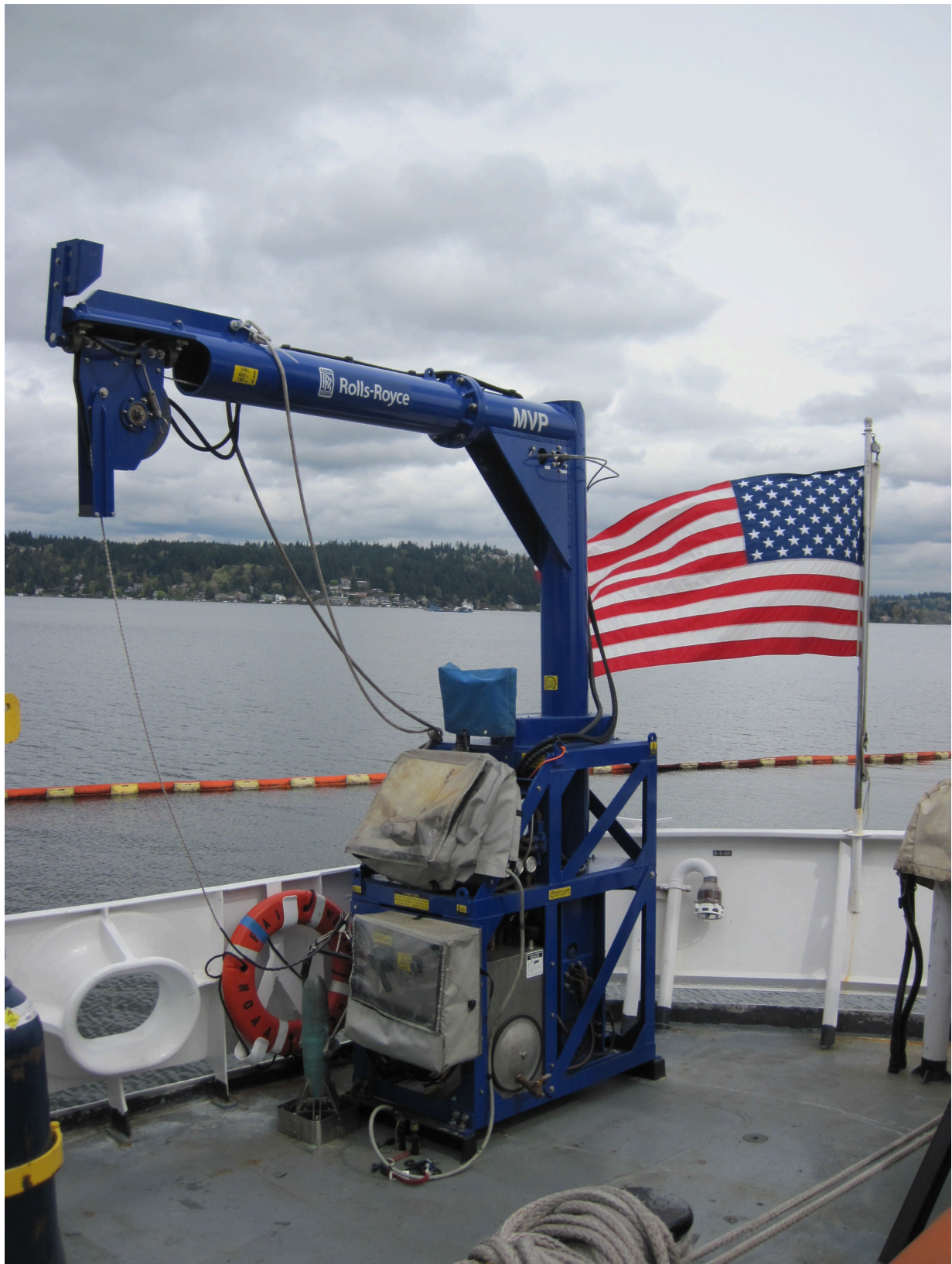
Figure 6: MVP 200 system