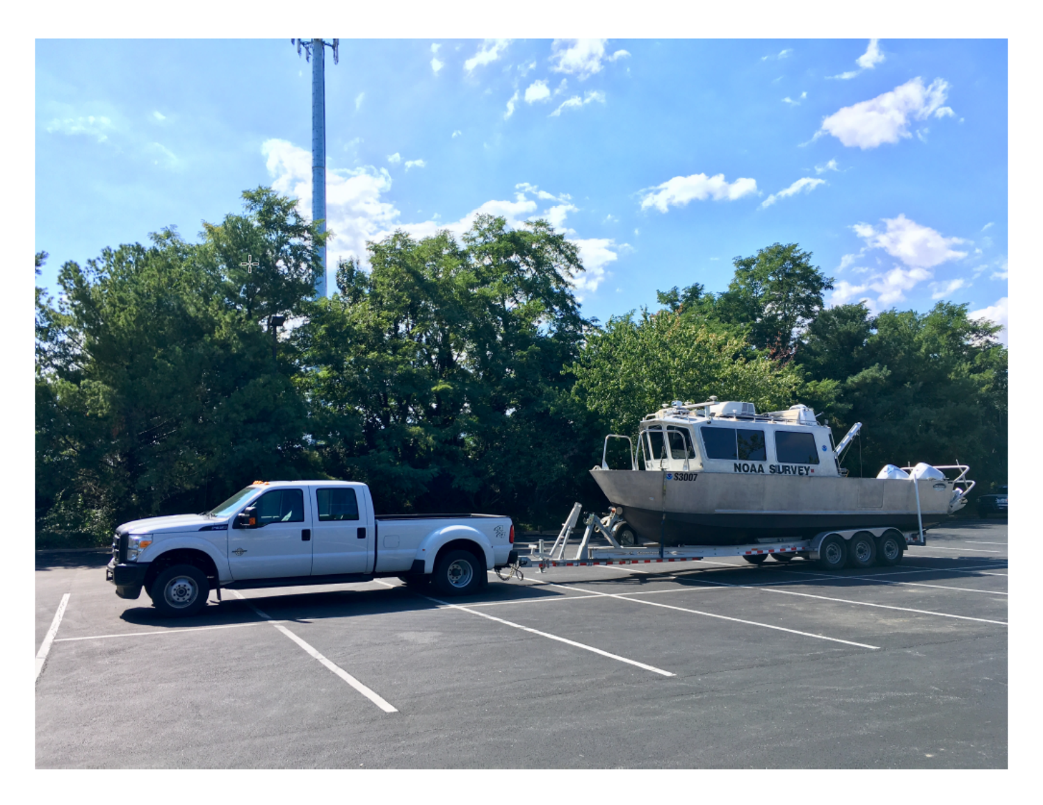
Figure 1: NOAA NRT-NL (S3007)