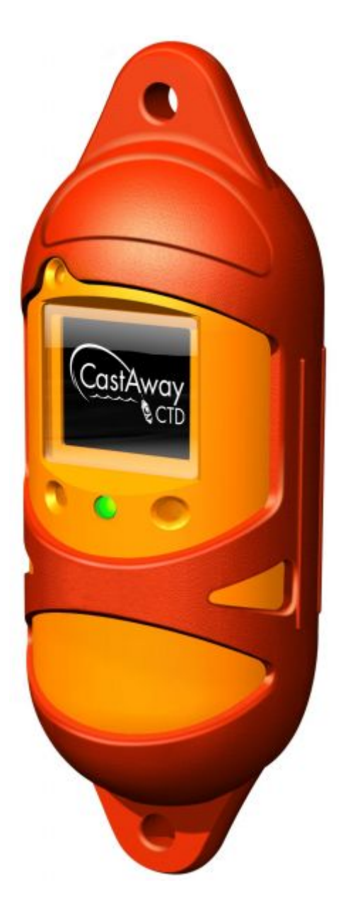
Figure 5: CastAway-CTD