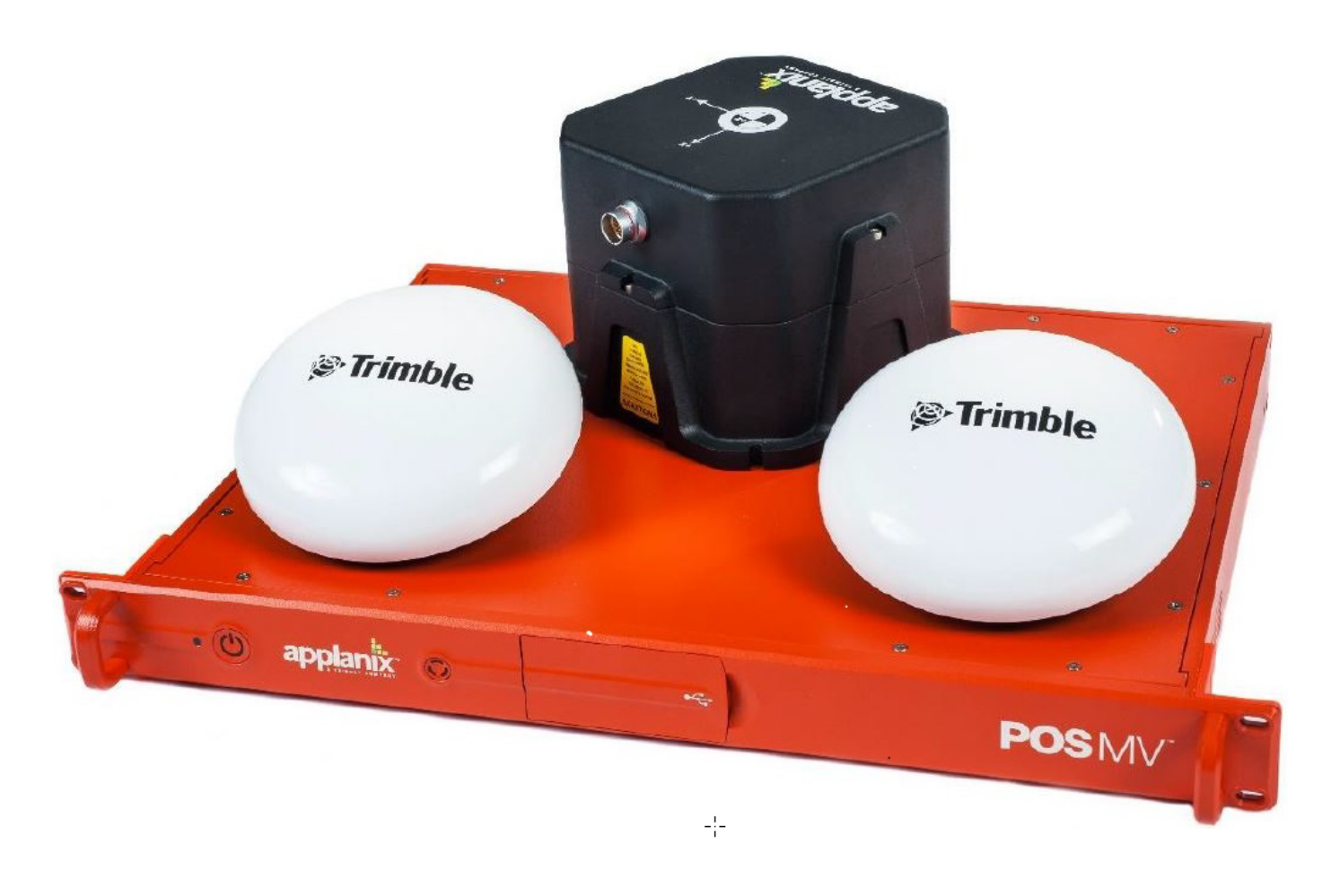
Figure 4: POS MV V5 system components: IMU, POS Computer System, and two GNSS antennas