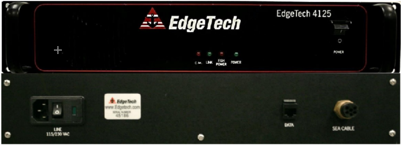
Figure 3: EdgeTech 4125 towfish and rack mount processing unit.