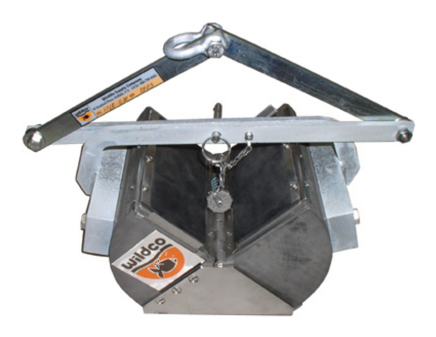
Figure 6: WILDCO Petite Ponar

The WILDCO Petite Ponar is a Ponar type grab sampler, a commonly used sampler that is very versatile for all types of bottom sediments such as sand, gravel, and clay. This sampler features center-hinged jaws and a spring loaded pin that releases when the sampler makes impact with the bottom. It also includes an underlip attachment that cleans gravel from the jaws that would normally prevent lateral loss of sample. The top is covered with a stainless steel screen with neoprene rubber flaps which allows water to flow through for a controlled descent and less interference with the sample. It is constructed of stainless steel with zinc plated steel arms and weights. A simple pin prevents premature closing.