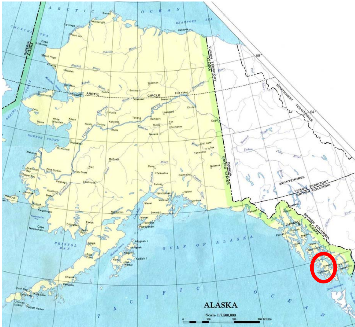
Figure 1 – General Locality of OPR-O190-KRL-08