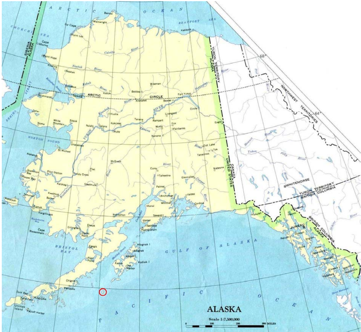
Figure 1 – General Locality of OPR-P133-KRL-06