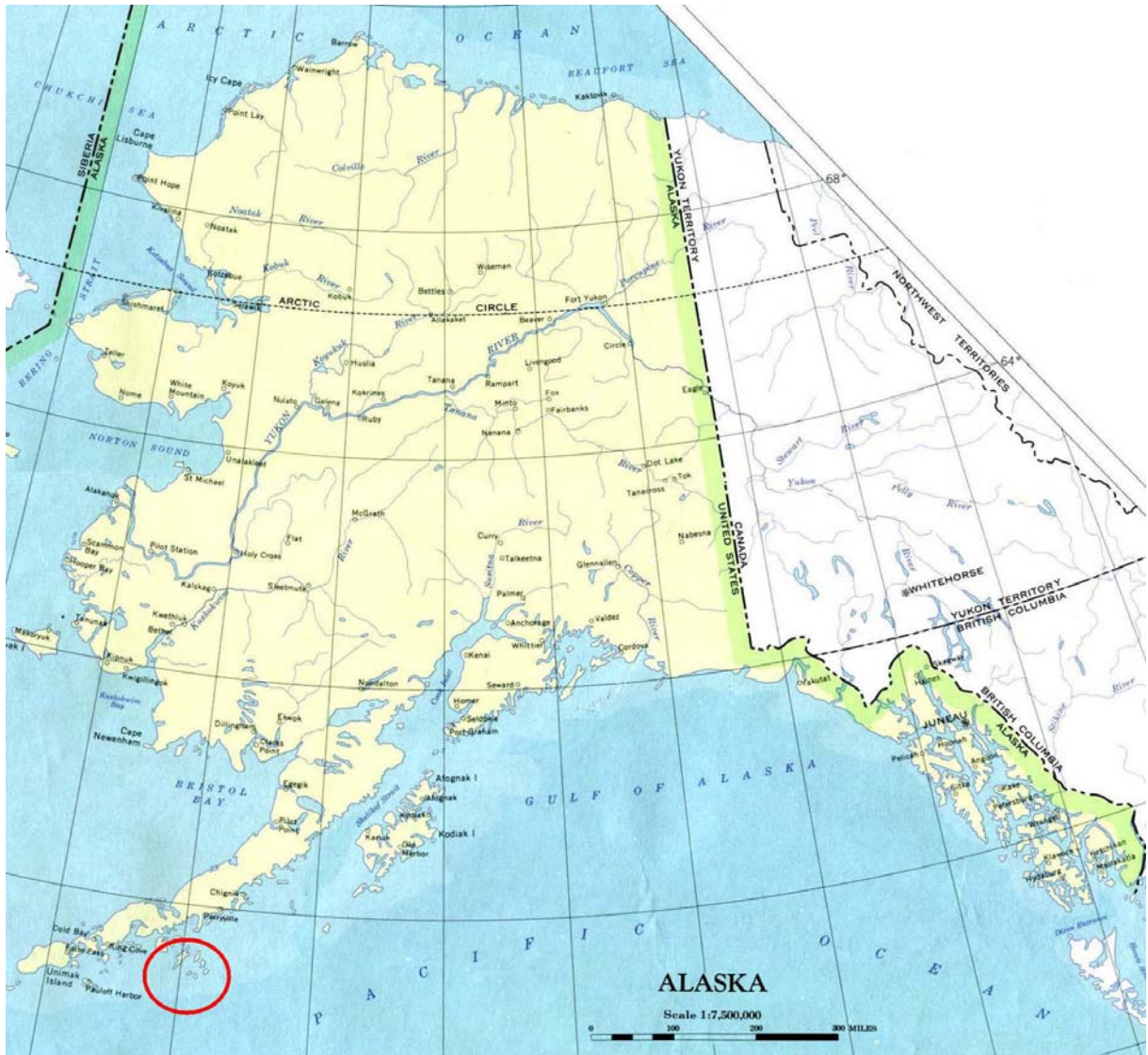
Figure 1 – General Locality of OPR-P183-KRL-09