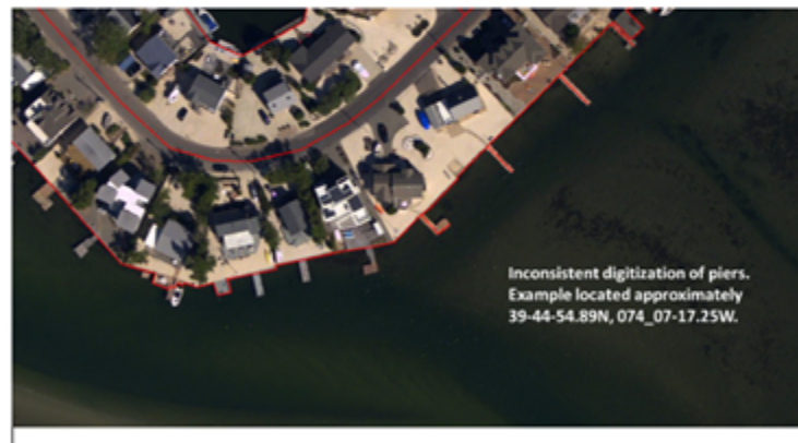
Figure 5: Example of inconsistent digitization of piers. Here we see the feature file (red) overlaid on the orthoimagery submitted for this survey.